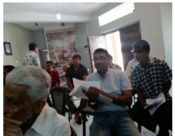
Participants checking the balance sheet