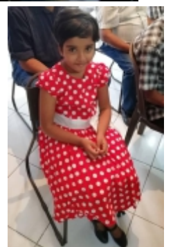
Our youngest Member in full attention