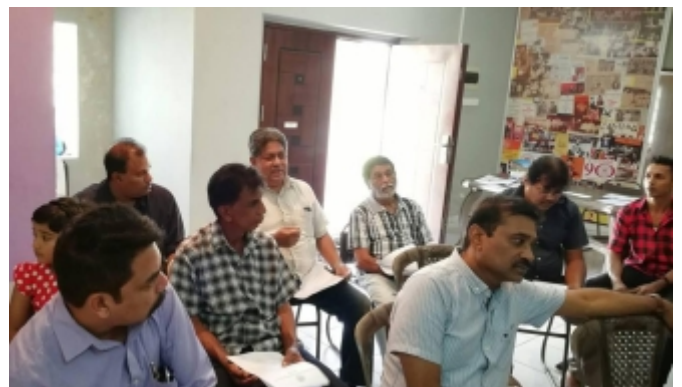
Some of the participating Members