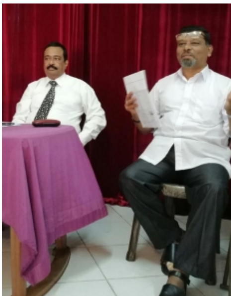
A satisfied Treasurer presents the audited accounts