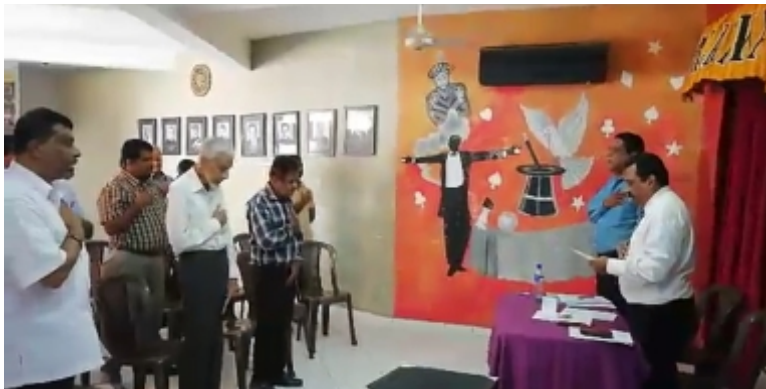
President administers the Oath