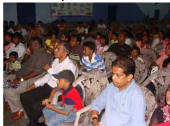
Section of the audience