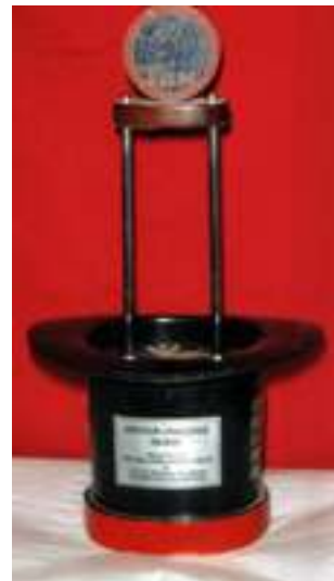
Linden De Alwis Challenge Trophy