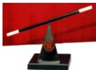
Donovan Andree Challenge Trophy