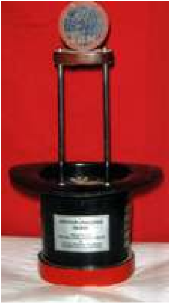
Linden de Alwis Challenge Trophy

The Junior Magician Contest for the Donovan Andree Challenge Trophy will be held on Sunday 27th July at 9.30 a.m. at the School hall, Lyceum International School, Nugegoda. This will be immediately followed by the Amateur Magicians Contest for the Linden de Alwis Challenge Trophy.