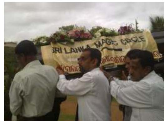
Members carrying the coffin to the crematorium