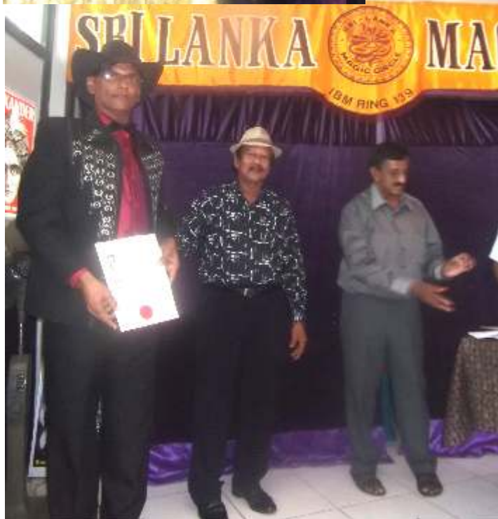
After receiving his award