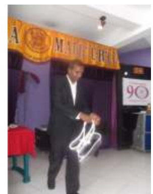
S K Dharmapala