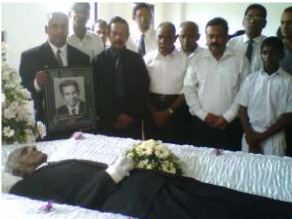
Paying the last respects

Thereafter the coffin was ceremoniously draped (as shown above) with the Circle flag prior to the funeral procession.