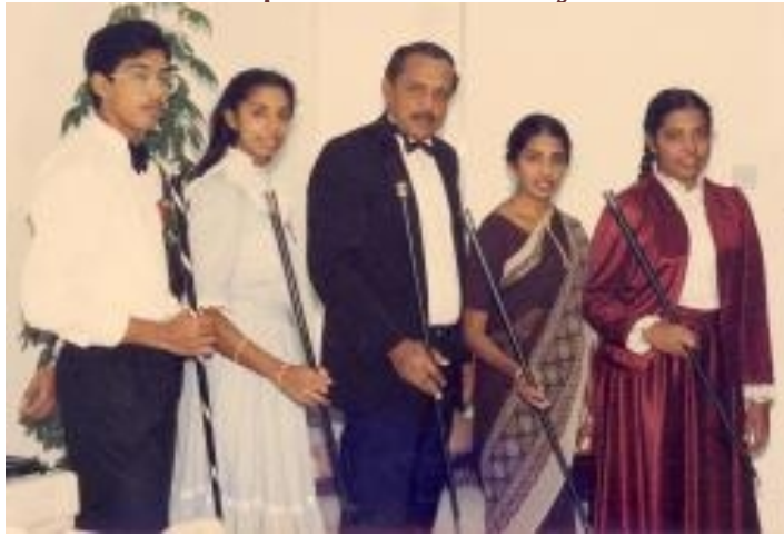
The Magical Weerasinghe family then and now

Another step down memory lane with H D N Gunesequera