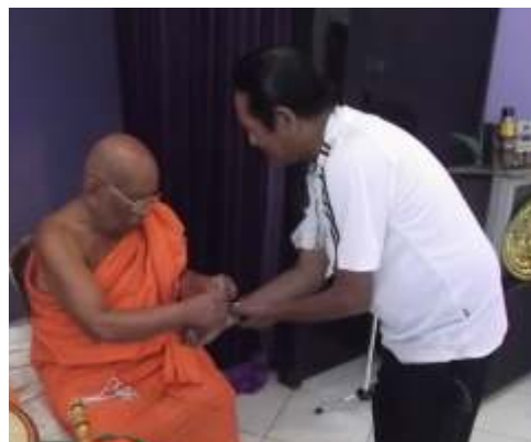
Tying of the pirith thread