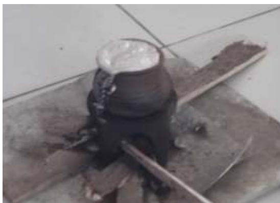
The pot of milk boiling