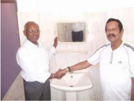
HDN presented a much needed Toilet Mirror set