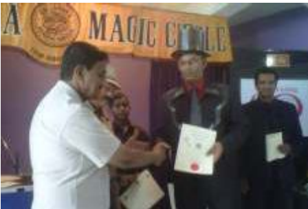
VP Contests Suranjith handing over the winner's certificate