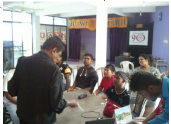
Picture shows the training in progress